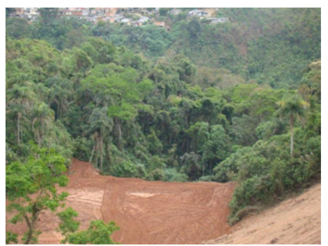
Environmental Preservation Area

It is important to notify that this is an extensive area of environmental conservation with the presence of native forests and springs that could not be invaded by houses or streets during the above mentioned drives.