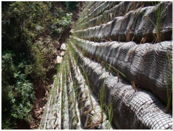
Tilting the green wall

As the chart indicates any degree of the slope, since it is inside the set for the planting of Vetiver, it is more efficient than other species. It also defines that the steeper the terrain the distance will be smaller between the barrier levels.