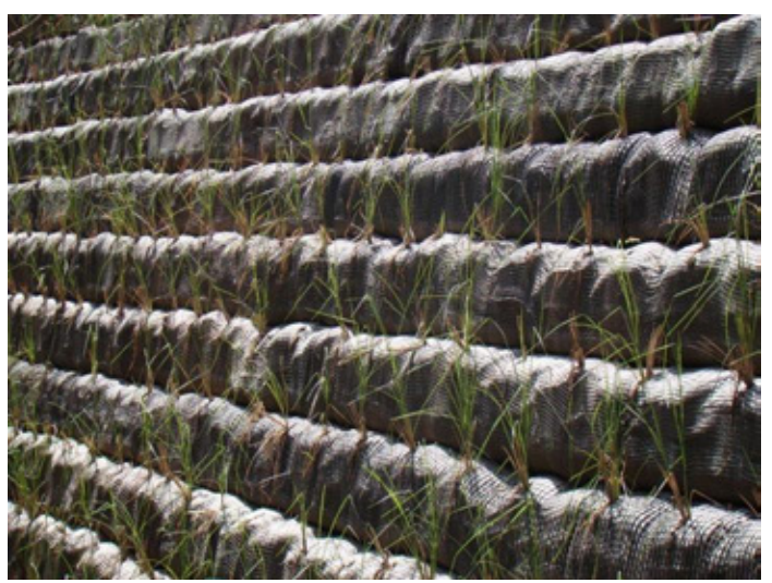
Vetiver in the face of the green wall

The characteristics of vetiver allow an adequate stabilization of the front of the wall because they have unique attributes that ensure the proper preservation of the system and it is actually a very effective tool in bioengineering: