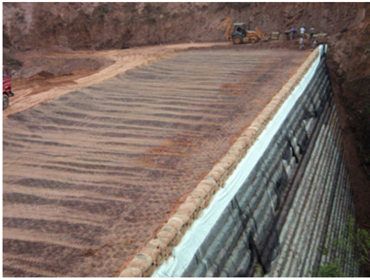
Side view of the green wall

The wall runs through the compression of a landfill in layers, interspersed (reinforced) with geogrids of high strength and high modulus. The entire landfill plus geogrids result in a mass of stable soil that acts as a wall of weight. In the front are used biodegradable bags filled with soil, geotextile and vetiver that are placed between the bags and geogrids as the cross section below.