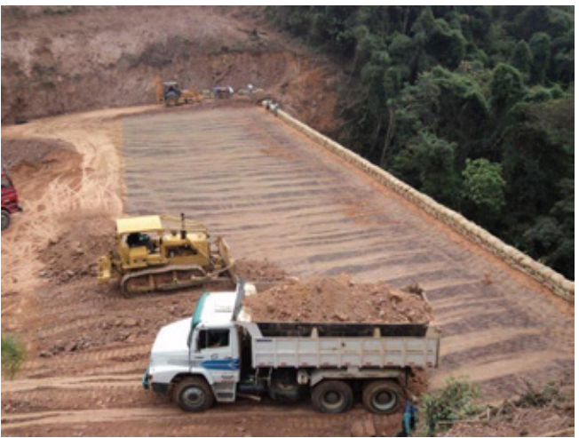
Filling site with soil

The inputs are basically the local soil, the geogrids used for reinforcement, the biodegradable bags used for the stability of the front, the geotextile for erosive protection in early process, and vetiver grass to stabilize the face of the wall.